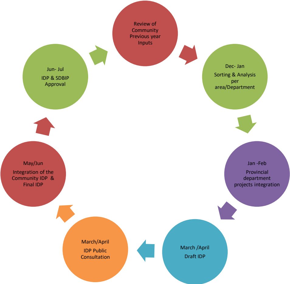
FIGURE 3: PROCESS FLOW FOR IDP COMMUNITY INPUTS

Figure 5, above, refers to the IDP community needs inputs process flow. The process flow provides a guideline on the IDP capturing of community inputs received during IDP roadshows. Immediately after the IDP Roadshows, the process flow indicates that community needs will be captured and submitted to Council Committees.