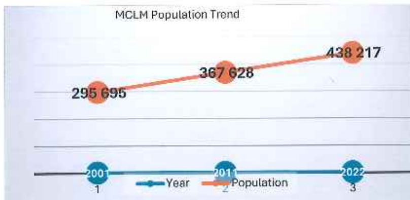
Figure 1: MCLM Population growth, 2011 to 2022, Stats SA

Figure 1, below, outline Statistics South Africa data of MCLM populations growth from 2011 to 2022 Census from 367 628 to 438 217 . Population growth rate from 2011-2022 was 23% which 70 589 more people.