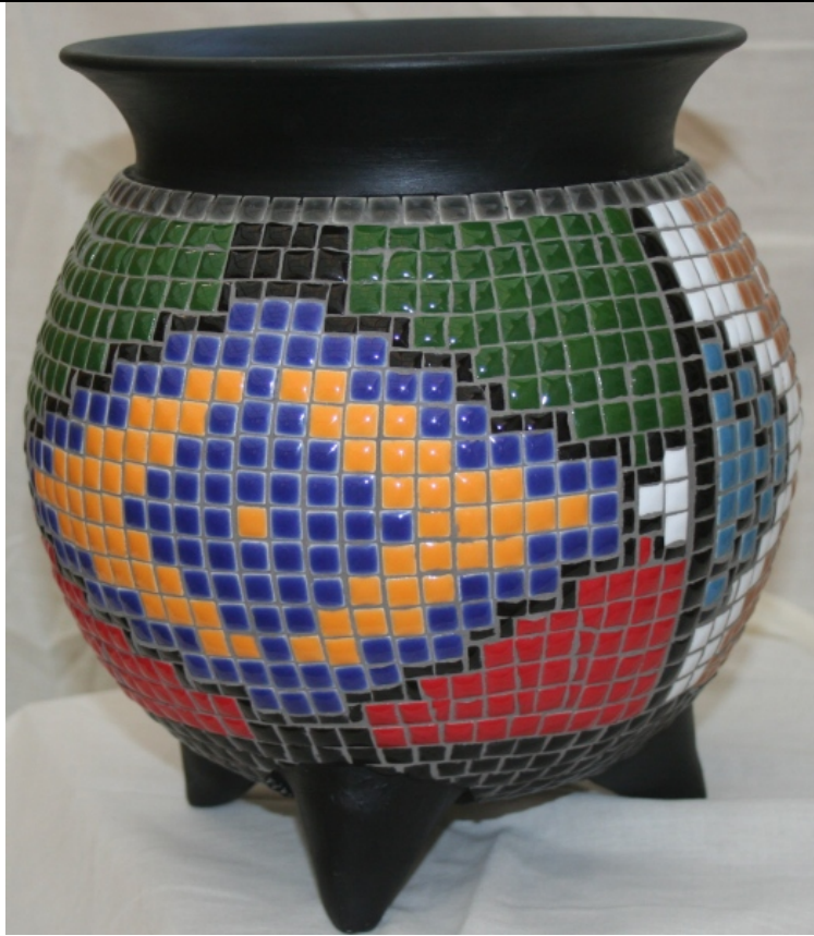
Photo 2 Another sample of proposed mosaic art finish reflecting Ndebele styling on art stands