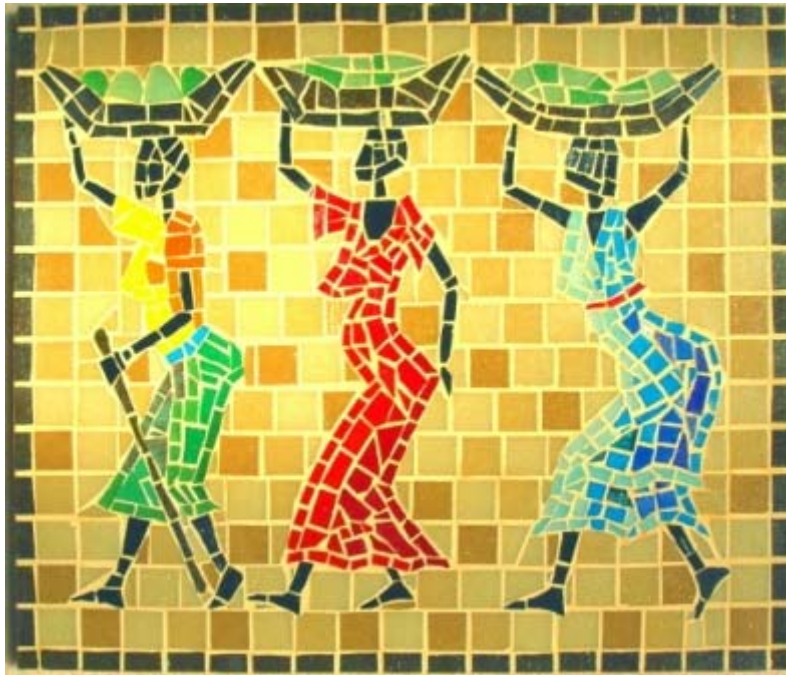
Photo 1 Sample of Mosaic Art pattern reflecting African cultural elements to be applied to art stand structures.